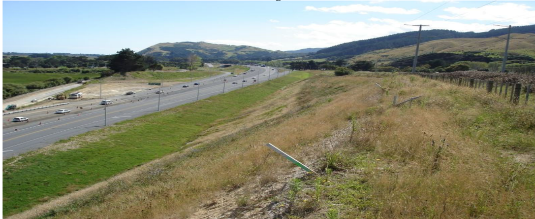
Above: The newly opened Mackays Crossing Flyover -a four lane rail over-bridge, separated interchange and underpass.

Initially Geotechnics Ltd opened up a branch in Wellington in November 2004 to provide Geotechnical services for the Mackays Crossing Over-bridge Project. Mackays crossing is located approximately 3 kilometres north of Paekakariki or a 35 minute drive north of Wellington City.