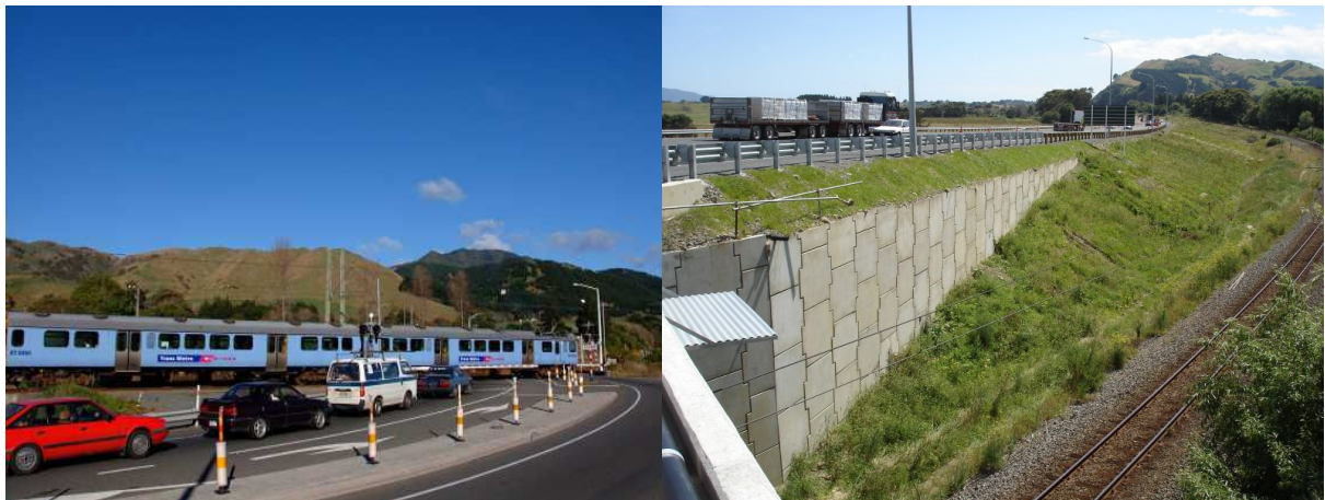
Above: The old level crossing (left) and the new over-bridge embankment (right) allowing free flowing traffic on S.H.1.

Following completion of the project, the Minister of Transport Hon Annette King cut the ribbon to declare the overbridge open on Saturday 24 March 2007, with an official opening ceremony at the near by Queen Elizabeth Park. The newly constructed over bridge now takes traffic up and over the main railway line, alleviating the traffic congestion which used to occur previously due to the old level crossing.